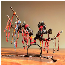
1. Kalpavriksha (Wishing Tree)

The exhibition is on from 2nd November 2023 till 29th February 2024