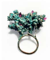
2. Kuber (Spirituality embodied in materiality)