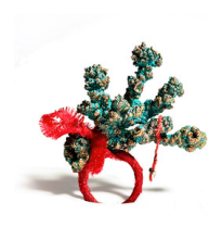
3. Sahjeevi (The tree's plea)