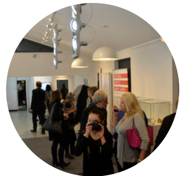
pics of the Magan Gallery