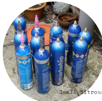
Small Nitrous Oxide Cylinders