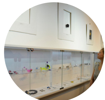
pic of the Magan Gallery

Deadline for completed applications: Midnight 17th July (UK time).